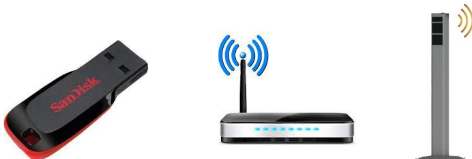
Picture 6: Data Collection ways, USB memory, WIFI system, Simcard internet